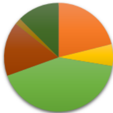
Total Levy Distribution